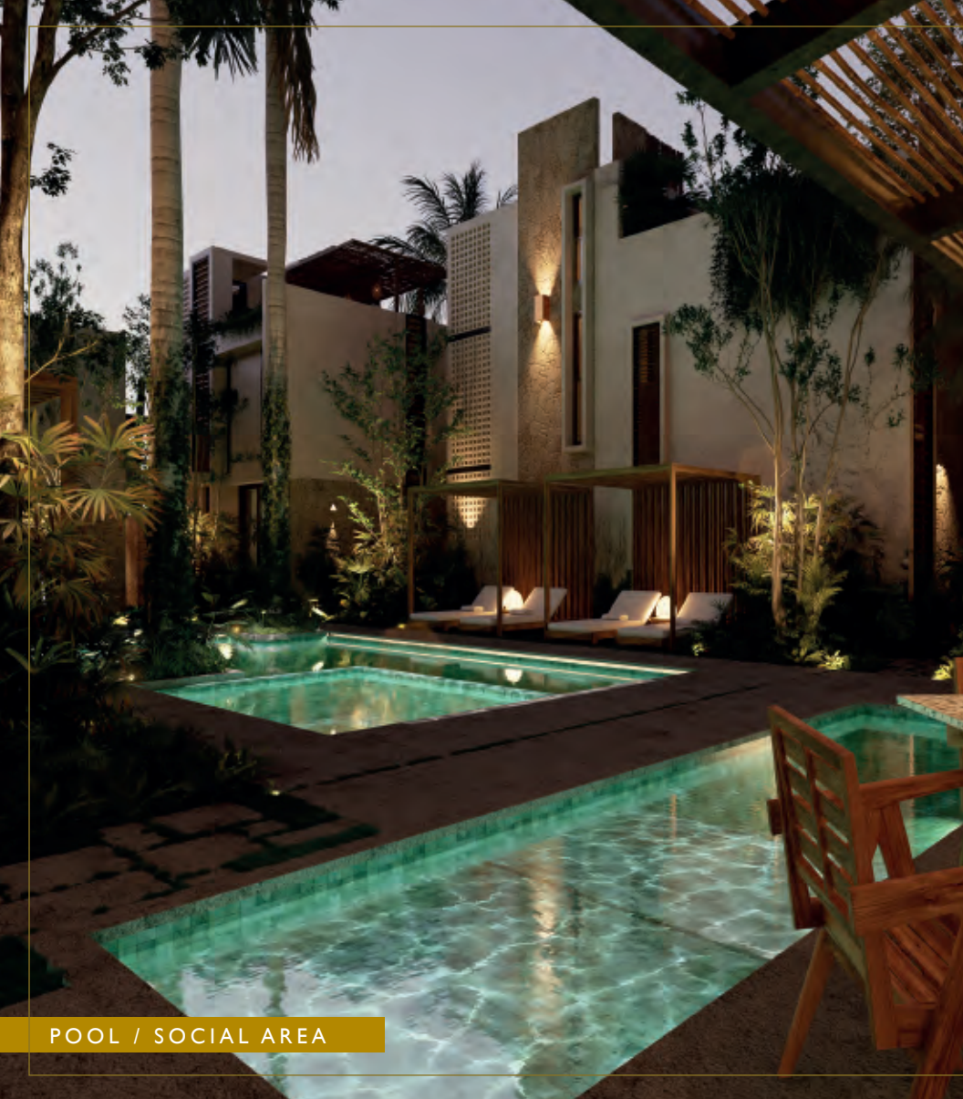
POOL / SOCIAL AREA